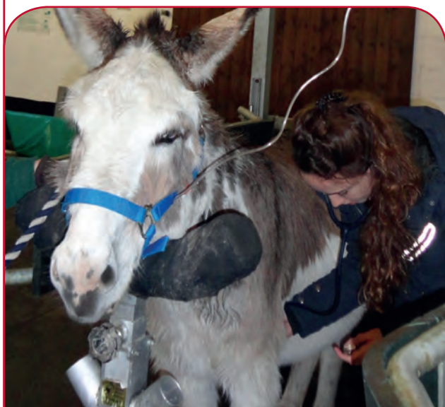
SERIOUS CASES MAY REQUIRE HOSPITALISATION AND INTENSIVE TREATMENT