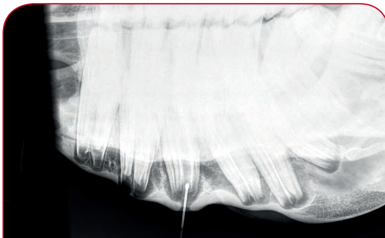
X-RAY OF LOWER MOLAR ABSCESS WITH PROBE INSERTED INTO TRACT TO HIGHLIGHT THE AFFECTED TOOTH

Thorough oral examination, using sedation, head stand, dental headlight, dental mirrors and picks will help identify any evidence of diseased teeth. Dental radiography can identify diseased teeth including root abscesses.