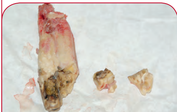
FRAGMENTED MOLAR TOOTH FOLLOWING REMOVAL BY DENTAL REPULSION

Recovery and aftercare of the patient is more involved than that following oral extraction.