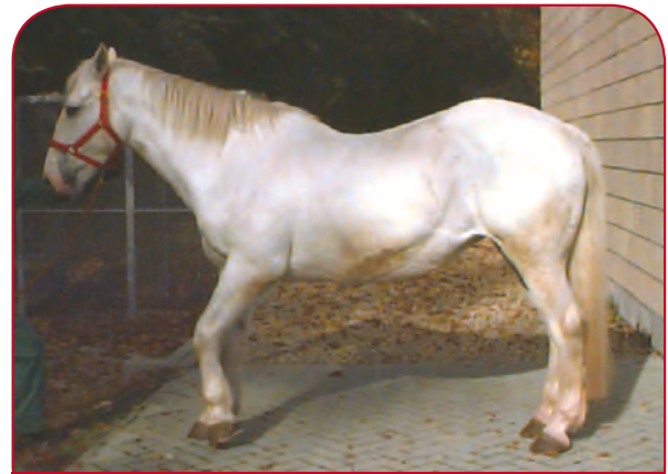
TYPICAL STANCE OF PONY SUFFERING FROM LAMINITIS