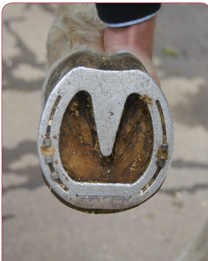
HEART BAR SHOES CAN PROVIDE FROG SUPPORT FOR CHRONIC CASES