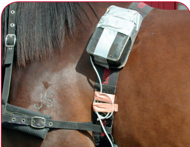
A SYSTEM FOR REMOTE RECORDING OF AN ECG DURING EXERCISE.

An electrocardiogram (ECG) looks at the electrical activity of the heart and can be used to assess rate and rhythm both at rest and during exercise using a remote device.