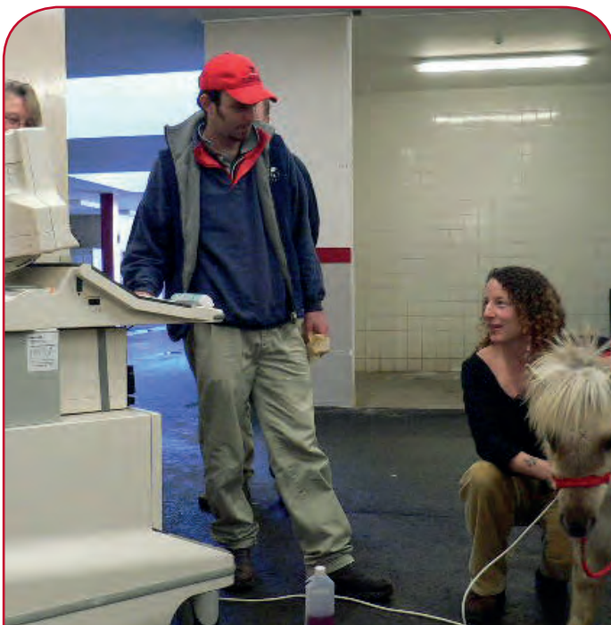
ULTRASOUND EXAMINATION OF THE HEART CAN PROVIDE INFORMATION ON THE SITE AND SIGNIFICANCE OF A HEART MURMUR

Heart murmurs are often discovered at a clinical examination or pre-purchase examination and can cause owners much anxiety. Although some heart murmurs can be performance limiting and / or life threatening, these are generally the exception rather than the norm. The majority of murmurs are physiological, i.e. of no consequence, and result from the passage of large volumes of blood at high speed through the large chambers of the horse's heart and major blood vessels. Indeed, a study of National Hunt horses in training revealed that close to 80% of them had heart murmurs which did not appear to be affecting their performance. Similar figures have been found in studies of human athletes.