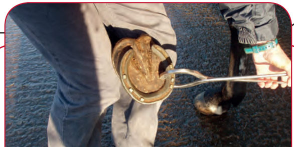
CHECKING FOR SOLAR PAIN USING HOOF TESTERS