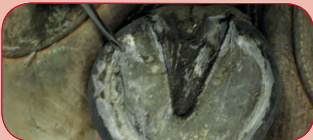
Paring the superficial layers of sole may reveal the discolouration of a bruise.