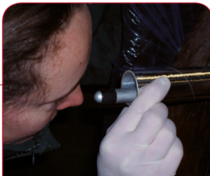
SPECULUM EXAMINATION OF THE CERVIX