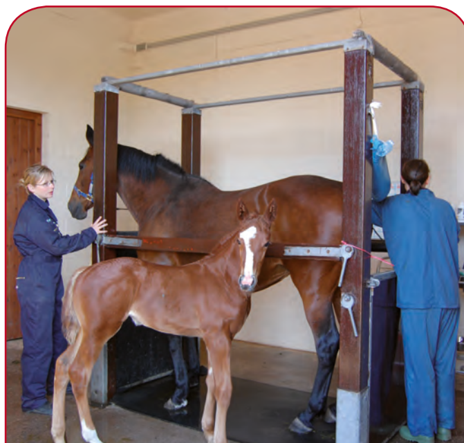
ULTRASOUND EXAMINATION OF THE UTERUS